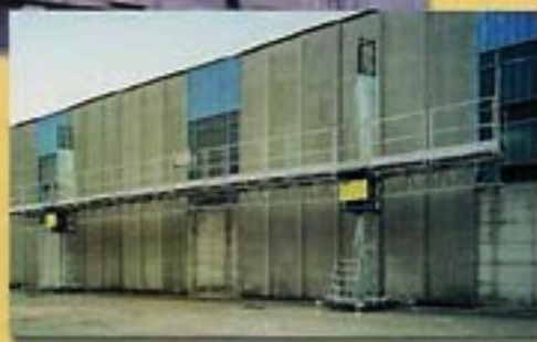
Twin mast 99' max. length.